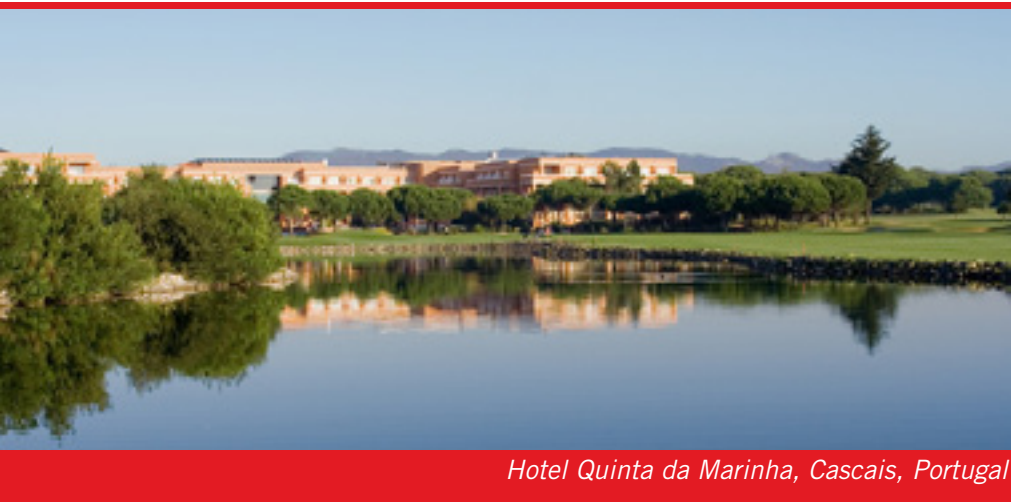
Hotel Quinta da Marinha, Cascais, Portugal