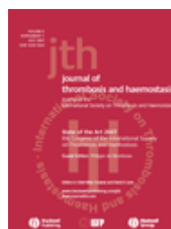
2007 State of the Art