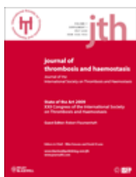
2009 State of the Art

Read the authoritative reviews from the 2009 STATE OF THE ART BOOK: